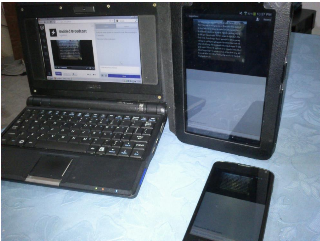
Figure 33 Multiple Clients

Another advantage of the proposed architecture is that it allows different types of Drama Streamers to be supported. That is, since the dramatization is taken from clients, it allows the same story to be rendered in different ways. In this particular aspect, a possible expansion of this architecture is to render the story in different graphical engines. This was a contribution of this work over Logtell's previous version, where the dramatization rendering engine was replaced, now they can be attached and extended, shown as the simple 2D dramatization done after remodeling this aspect of the model.